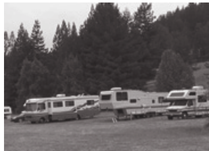
RV's and Tent Campers Welcome

Accommodations: You could make a vacation around this event. Self-contained RVs and tent campers are welcome to set up from 6/20 - 6/24. Campfires only in designated areas. There are no 120v hookups. There is a chemical blue room in the meadow. Restrooms at the degree site have hot water and a shower in the men's is available to women. Motels are available at the coast, 30 minutes on a dark and winding road from the RAM site. Call as soon as possible for your reservations, it's a popular tourist area.