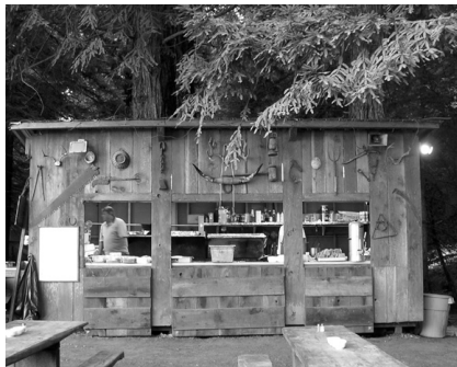
Comptche Cook Shack

TRADEWINDS LODGE (707) 964-4761 SURF MOTEL (707) 964-5361 SURREY SUPER 8 (800) 206-9833 FOOLS RUSH INN (707) 937-5339 HARBOR LITE LODGE (707) 964-0221 SEA FOAM LODGE (707) 937-1827 RESERVE EARLY!!